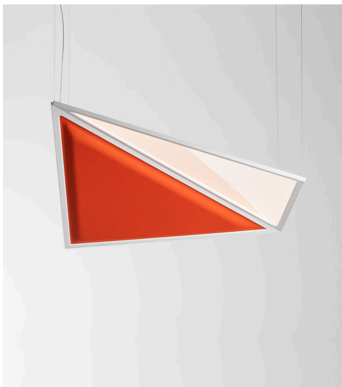
Flexia Suspension, Mario Cucinella

It fits transversely into all contexts where acoustic and visual well-being is required.