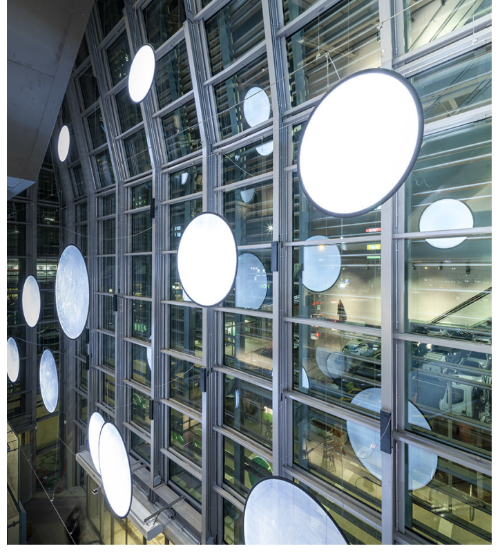
Discovery Vertical - Ernesto Gismondi

The transparent surface comes to life with a white or coloured light, green in honour of Green Pea, for a spectacular solution, which can also be glimpsed from the outside through the façade.