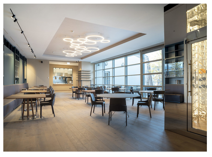
Ripple - BIG | Vector 95 - Carlotta de Bevilacqua