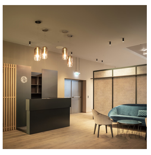
Gople - BIG | Vector Semirecessed - Carlotta de Bevilacqua

The Artemide lighting project follows the interior and exterior spaces with products that are the result of the collaboration with the major international architects who express choices that are attentive to the limited resources of our planet: BIG with Alphabet of Light , Ripple and Gople , or Elemental by Alejandro Aravena with "O" , to name just a few.