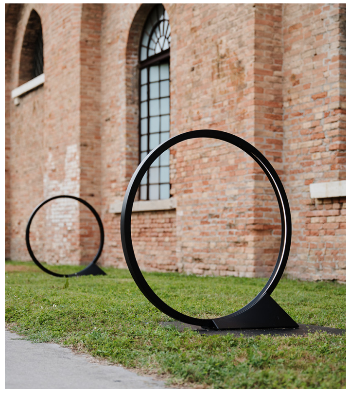
"O" by Elemental

La Biennale di Venezia is a place of listening, of inspirations and new encounters. This is where the collaboration with Alejandro Aravena was born in 2016, whose "O's" today illuminate the paths of the Arsenale with respect for nature, relating to the context like a frame that fits to underline perspectives.