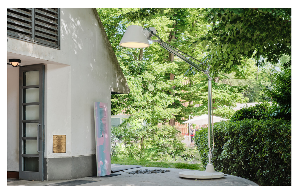
Tolomeo XXL by Michele De Lucchi and Giancarlo Fassina