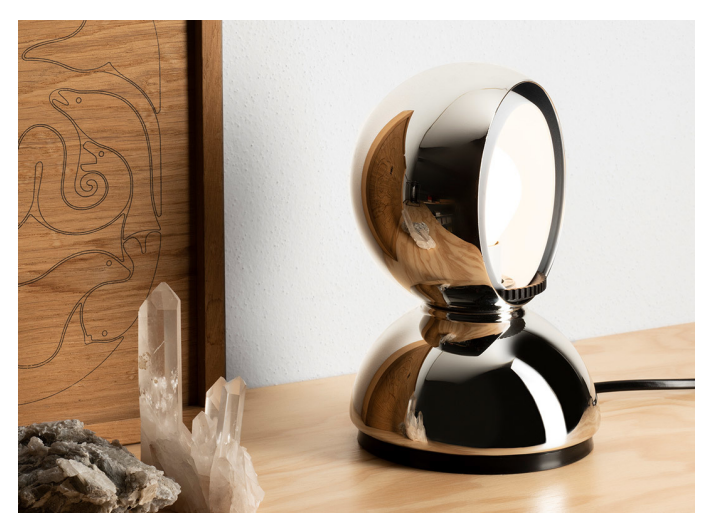
Eclisse PVD Mirror - Vico Magistretti