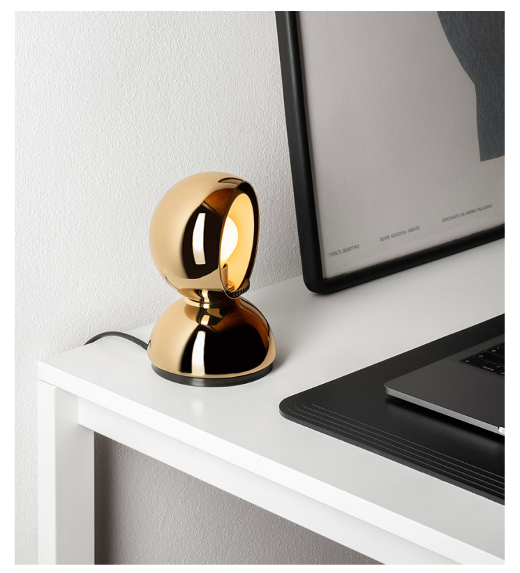
Eclisse PVD Brass - Vico Magistretti

The PVD versions of Eclisse are a perfect example of how Artemide's research into materials, finishes and processes is strongly oriented towards sustainable solutions. In the design choice, the environmental impact is a discriminating factor that imposes itself on the final aesthetic result.