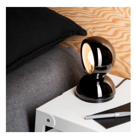
Eclisse PVD Black - Vico Magistretti