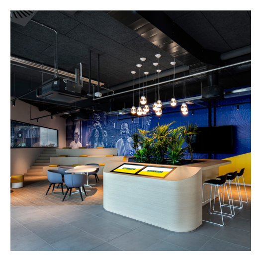
Empatia - Carlotta de Bevilacqua