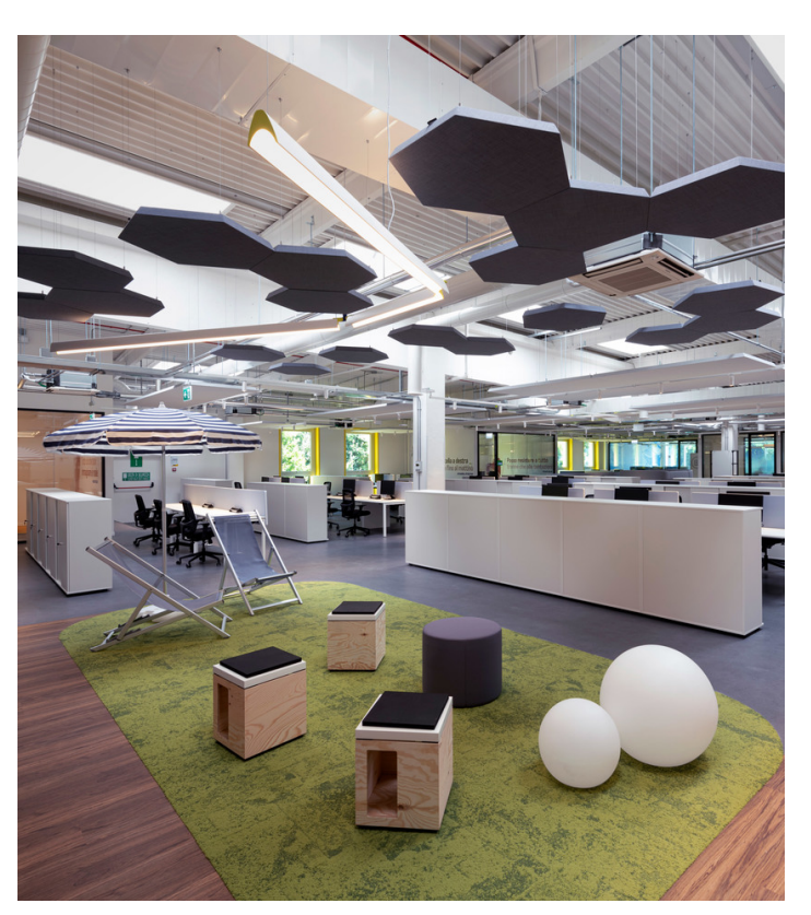
Series Y - Gensler | Dioscuri - Michele De Lucchi

The layout was designed to meet the characteristics and needs of the different departments of the company and the people who are part of it. Each area is projected to change according to the work requirements, between formal and informal spaces to promote comfort, dynamism and creativity according to the needs of professionals.