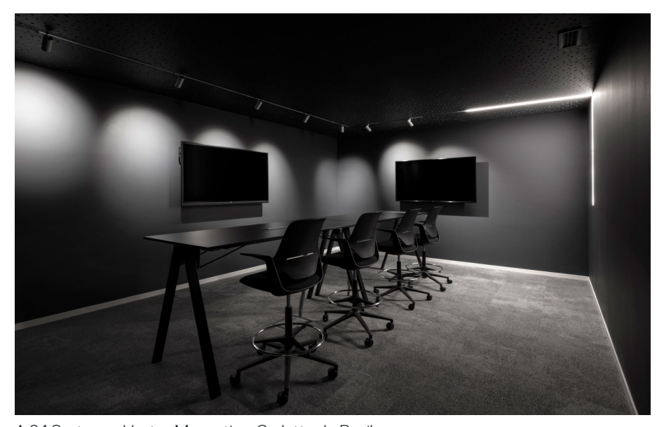
A.24 System + Vector Magnetic - Carlotta de Bevilacqua