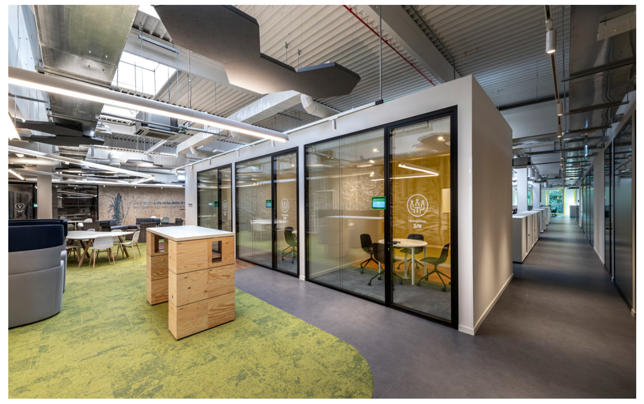
Series Y - Gensler | Vector - Carlotta de Bevilacqua