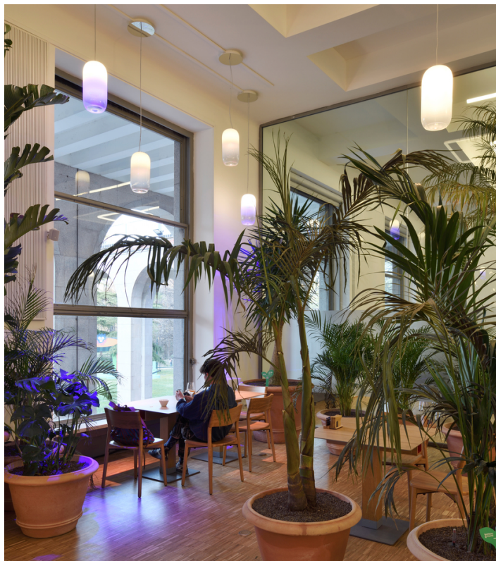
Gople & Gople RWB - BIG

A series of Gople, handcrafted glass suspensions designed by BIG, illuminate the cafeteria tables. The presence of nature even in indoor spaces becomes essential, which is why the RWB version of Gople was also introduced, this is an innovative technology capable of nurturing nature by supporting its growth with the right wavelength.