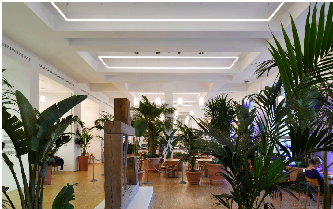
Gople - BIG | Alphabet of Light - BIG

Alphabet of Light, by BIG, enhances the architecture with continuous lines of diffused and comfortable light that follow it thanks to the flexibility of the patented system.