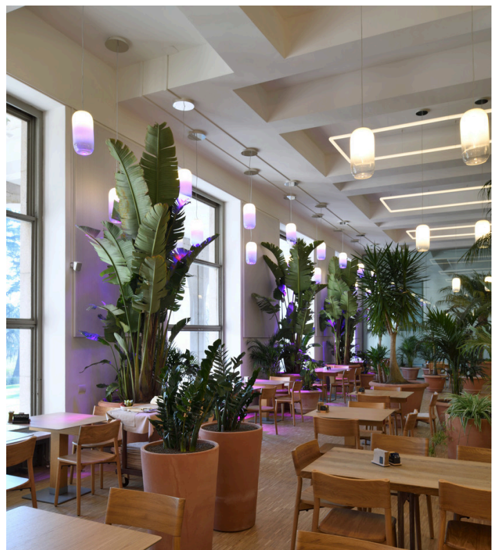
Gople - BIG

Artemide once again renews its collaboration with Triennale Milano , a prestigious cultural institution and reference point for a city that is an international symbol of design. It does so by illuminating the spaces of the renovated Caffè Triennale with products that bear witness to innovation and made in Italy, sustainability and dialogue with architecture and nature.