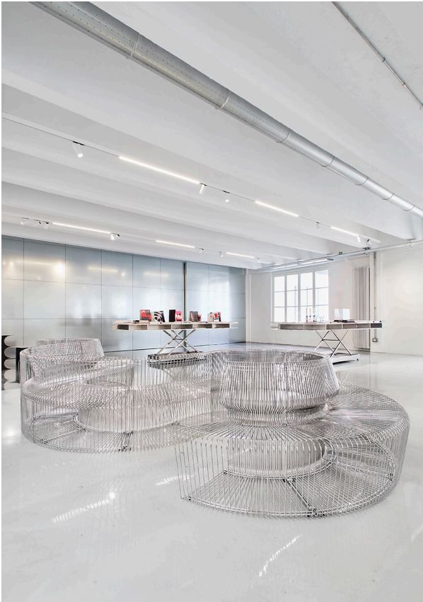
A.24 + Vector 55 - Carlotta de Bevilacqua