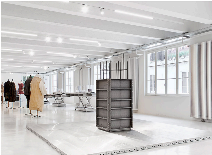
A.24 + Vector 55 - Carlotta de Bevilacqua