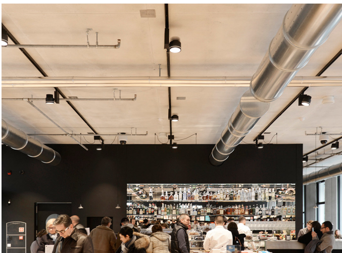
Picto 125 High Flux - Studio Artemide