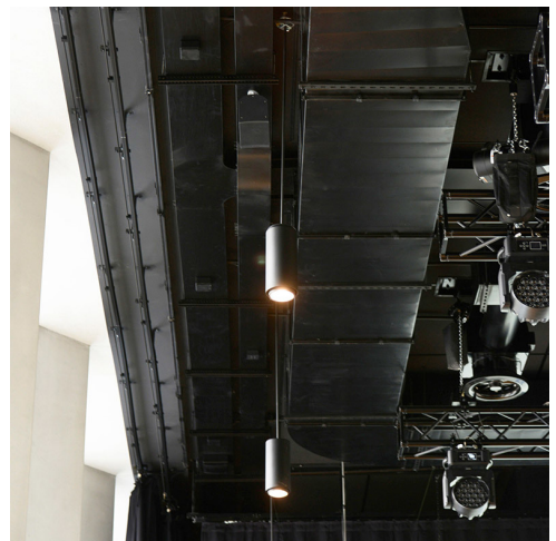
Special version of Ourea