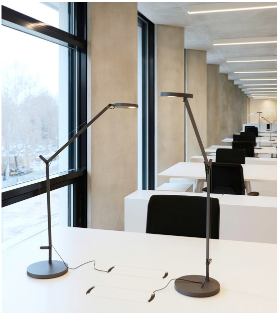
Demetra - Naoto Fukasawa

In the third and fourth floor office environments, the Algoritmo system, integrating with the architecture, defines a uniform illuminance perfect for workspaces where each workstation is also supported by Demetra task light table.