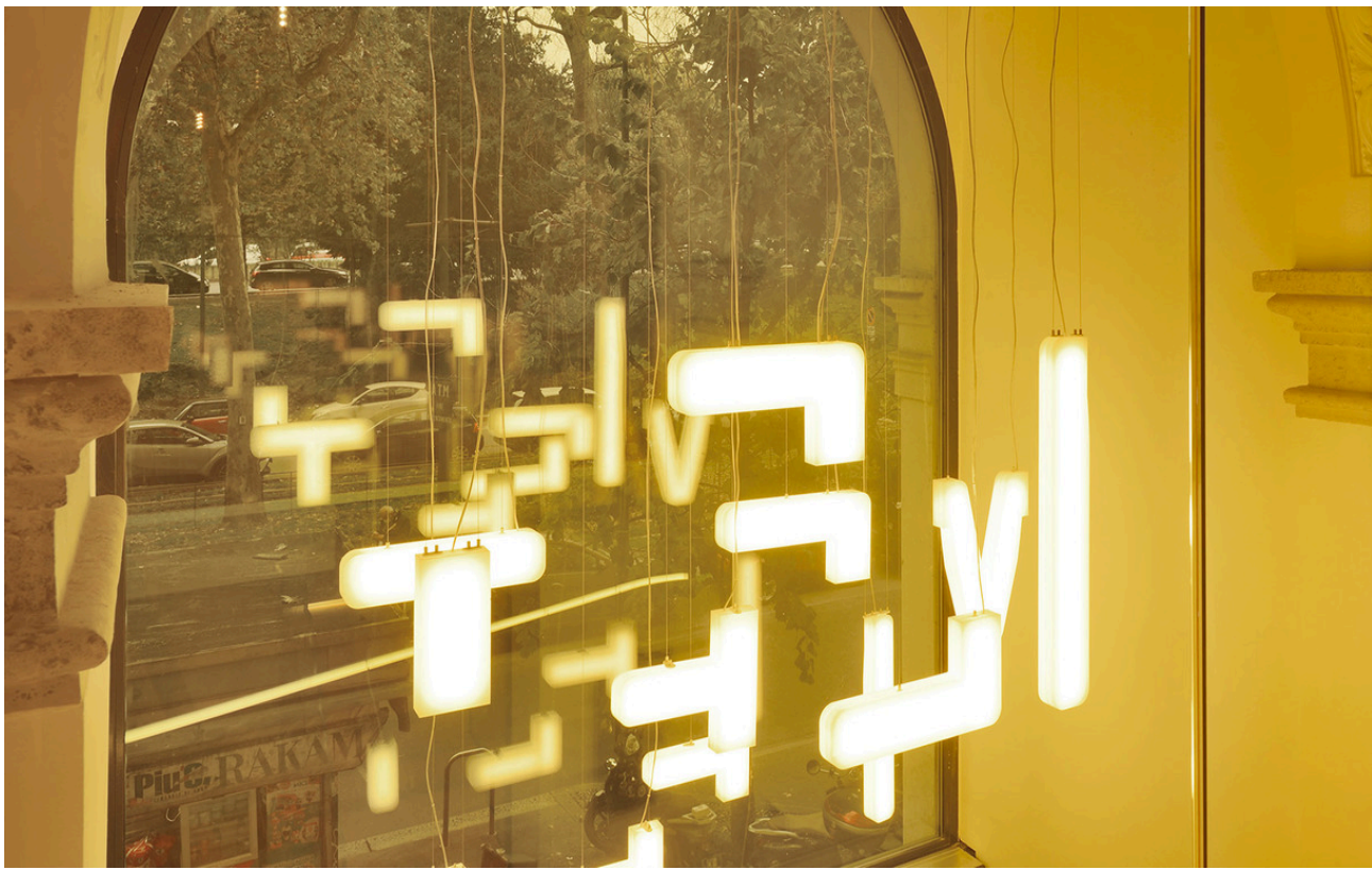
Custom Chandelier by Artemide & Carlo Ratti