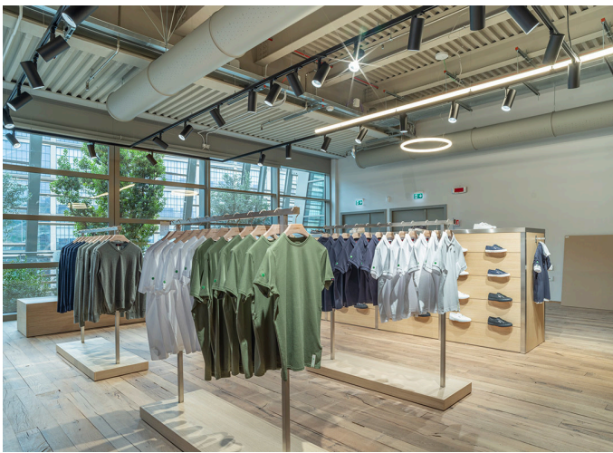
AoL - BIG | Vector Track - Carlotta de Bevilacqua