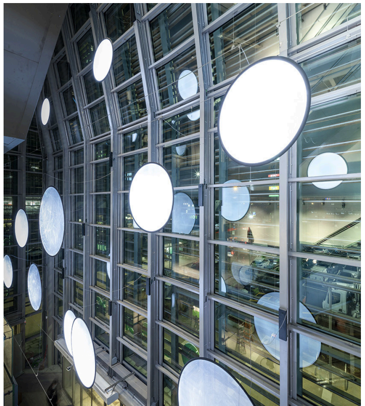
Discovery Vertical RGBW - Ernesto Gismondi

A cluster of 28 Discovery lamps, specially made in the custom size of 190cm, welcomes the visitor in the full-height space that connects the five floors. The transparent surface comes to life with a white or coloured light, green in honour of Green Pea, for a spectacular solution, which can also be glimpsed from the outside through the façade.