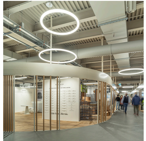
AoL Circular - BIG

A cluster of 28 Discovery lamps, specially made in the custom size of 190cm, welcomes the visitor in the full-height space that connects the five floors. The transparent surface comes to life with a white or coloured light, green in honour of Green Pea, for a spectacular solution, which can also be glimpsed from the outside through the façade.