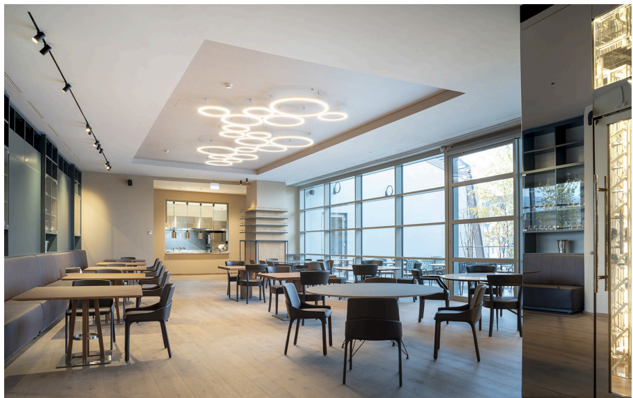
Ripple - BIG | Vector 95 - Carlotta de Bevilacqua