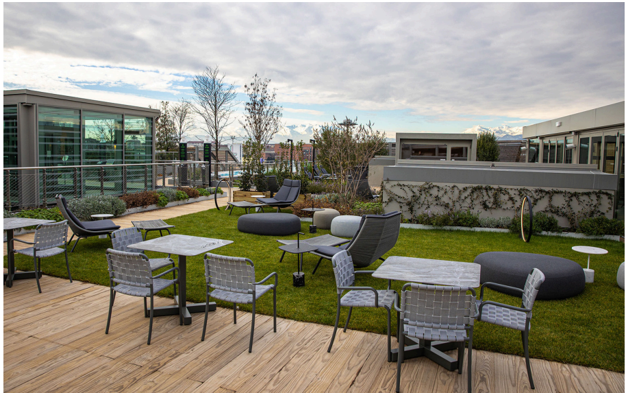
"O" - Elemental