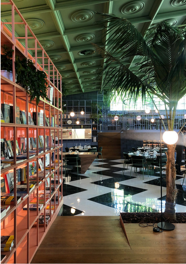
nh S5 Elliptic - Neri&Hu