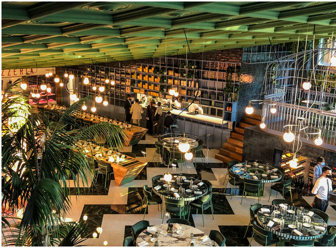
nh - Neri&Hu