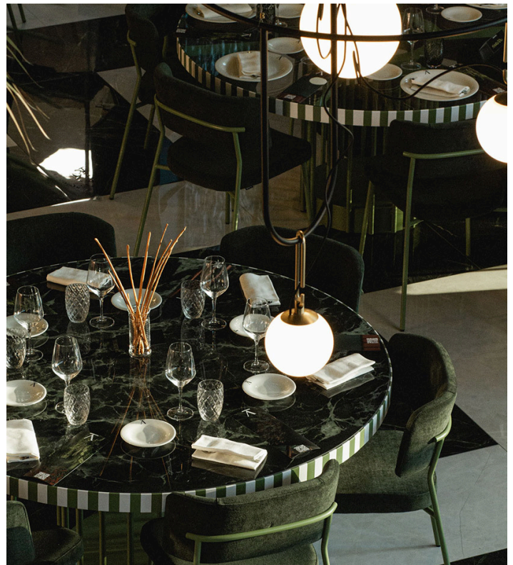
nh S4 Circulaire - Neri&Hu