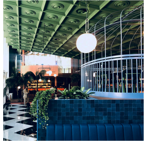
nh 35 Suspension - Neri&Hu

The renovation includes using the old cinema as a large atrium-like space.