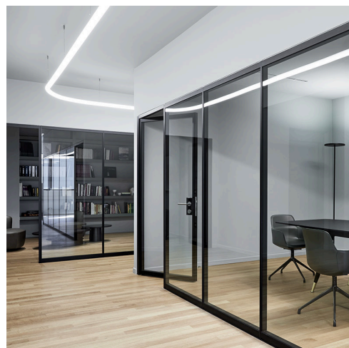
AoL System - BIG

The space is designed to contain and allow different activities to be carried out. Inside this first building there are rooms of various functional types, including a thematic library, a wine cellar containing about three thousand bottles, a lounge area, a bar, a kitchen and a small green area.