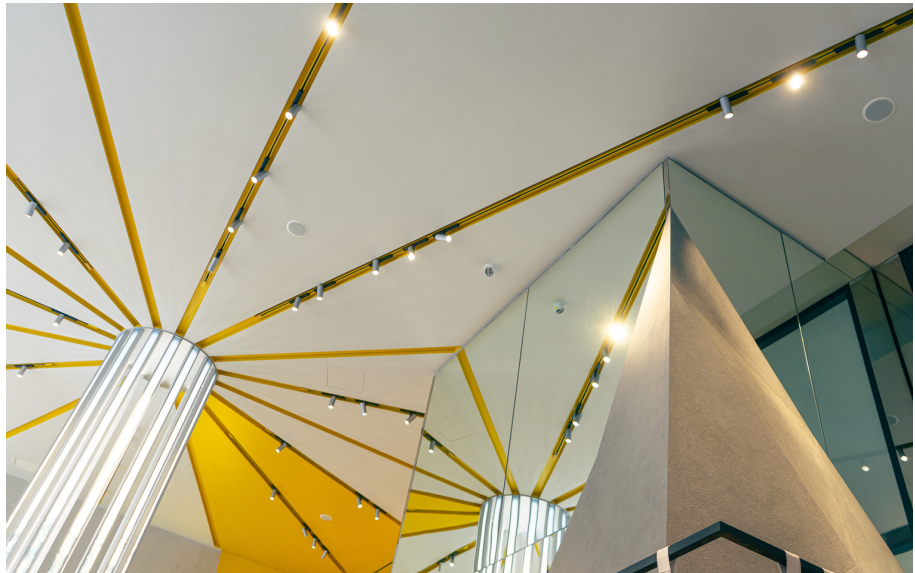
Turn Around + Vector - Carlotta de Bevilacqua